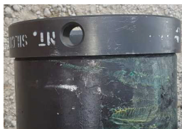
TSH MACII / SLX